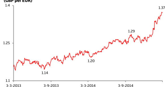
Appreciation of British pound (GBP per EUR)

The UK economy grew by 2.6% in 2014, the highest rate in the G-7, as the number of unemployed fell by over 20% with 5.7% of the population unemployed in December 2014, the lowest rate since mid-2008. A side effect of the UK's strong economic performance has been a steady rise in the pound since early 2013. The value of the pound has gradually increased by 20.4% relative to the euro since March 2013 including a sharp drop of 7% since the beginning of 2015 alone. The pound closed at EUR 1.37 on 2 March 2015, the highest level seen since 2007.